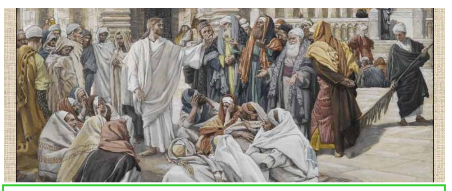
Sunday 2 September - 22nd Sunday in Ordinary Time